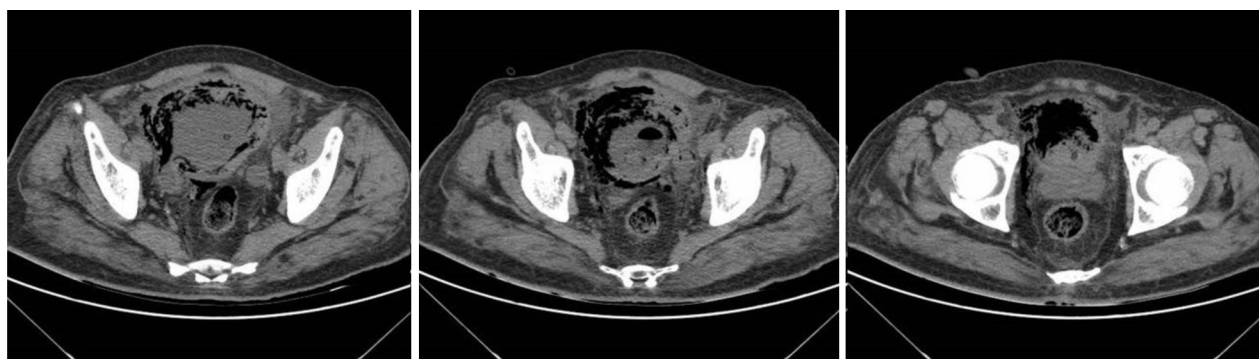
Figure 1. The Computed Tomography (CT) scan of the abdomen and pelvis revealed diffusely increased wall thickness with air bubbles within the bladder wall and disruption of the bladder wall with air bubbles within the para-vesicle spaces.

In light of the patient's condition and the CT scan results, after taking the urine cultures, ceftriaxone 1 g